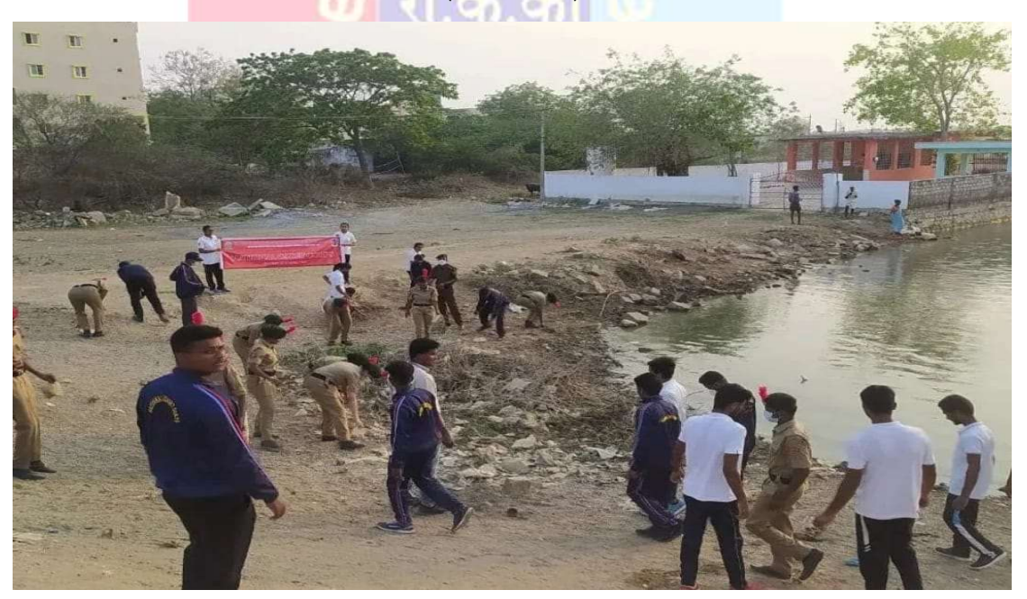
Puneet Sagar Abhiyan Cleaning of Lake (Bheemaram)